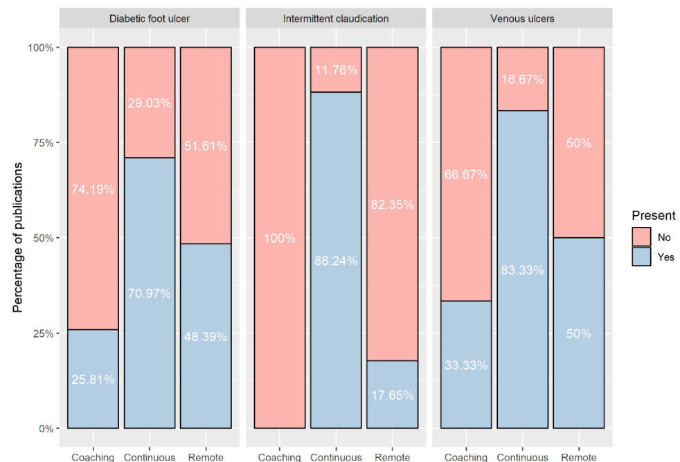
Figure 3. Share of number of publications presenting coaching (including alerts and recommendations), continuous and remote monitoring capabilities, per disease.